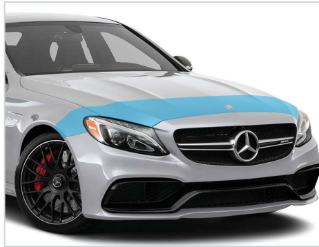
Partial Hood and Fender

Clear gloss polyurethane for stone chip protection, high wear, and abrasion in the automotive, motorcycle, RV, powersports, bicycle, aircraft, and other transportation markets.